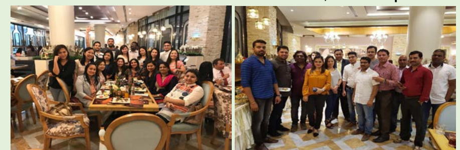
Many thanks to our CEO for funding this occasion!

"INVESTORS In PEOPLE" IFTAR DINNER of DREAM GROUP & PROFESSIONAL CATERING employees at MADO Cafe & Restaurant – Seef Mall, Muharrag